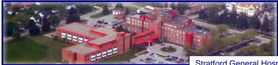
Stratford General Hospital

CT exams are being reported electronically from the Advantage Windows Workstation.