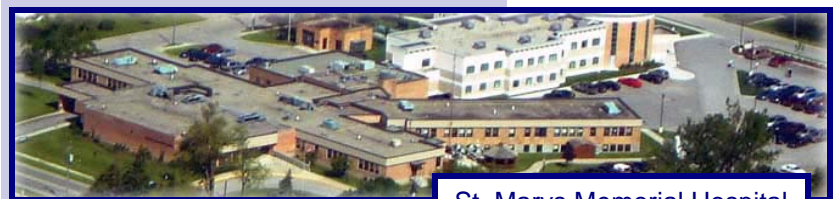
St. Marys Memorial Hospital