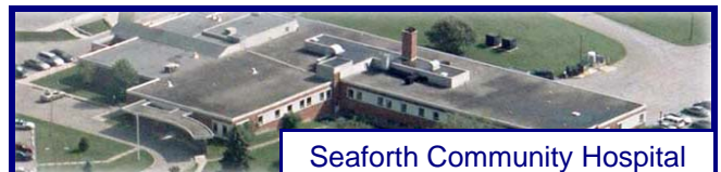
Seaforth Community Hospital